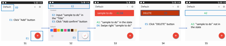
Fig. 1. The test process of “Add and remove an item” in a To-do app

assertion (A1) checks for successfully adding one item by verifying that “sample to do” appears in the new state (S3). The user then swipes right on the “sample to do” item (E4) and clicks the “DELETE” button (E5). The other assertion (A2) checks for successfully removing this item by verifying that “sample to do” no longer appears in the new state (S5).